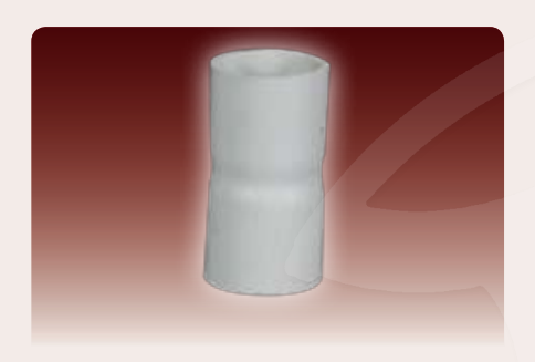
Rigid PVC Coupler