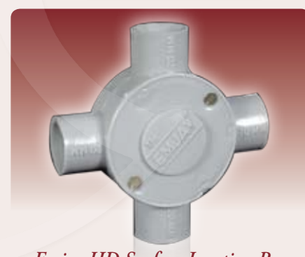
Emjay HD Surface Junction Box