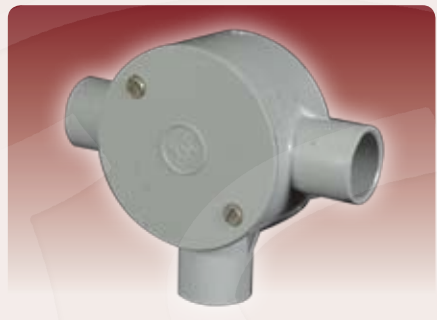
'JSC' Rigid PVC Surface Junction Box